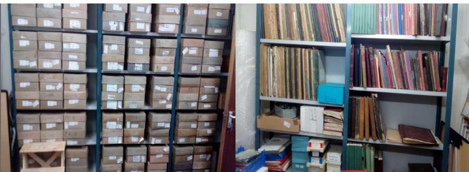
Some of the Archival Collections in An Daonchartlann, Loughlinstown.